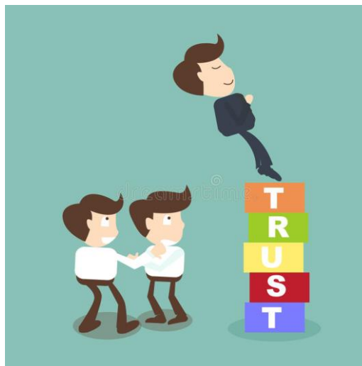
Building trust 11

For more details and the "How-to ToC" process, please consult the recent UNDP Handbook, 'Improving the impact of preventing violent extremism programming: a toolkit for design, monitoring and evaluation'. 10